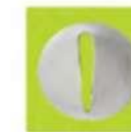
玫瑰花嘴(6入) Pastry Tube (pc/bag) 304 不銹鋼 304 Stainless Steel CS80126 19X24X34.5