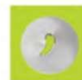
玫瑰花嘴(6入) Pastry Tube (pc/bag) 304 不銹鋼 304 Stainless Steel CS80206 8X18X26