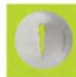
玫瑰花嘴(6入) Pastry Tube (pc/bag) 304 不銹鋼 304 Stainless Steel CS80026 11X17.5X31