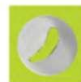
玫瑰花嘴(6入) Pastry Tube (pc/bag) 304 不銹鋼 304 Stainless Steel CS80256 17X24.5X36.5