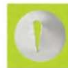
玫瑰花嘴(6入) Pastry Tube (pc/bag) 304 不銹鋼 304 Stainless Steel CS80005 12X18X28