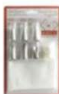
花嘴(小韩国) Pastry Tube 304 不锈钢 304 Stainless Steel CS8405 6粒装