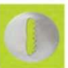
半排花嘴-5(6入) Pastry Tube (pc/bag) 304 不銹鋼 304 Stainless Steel CS80436 9X17.5X28