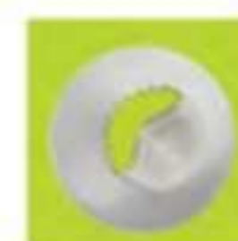
半排花嘴-9(6入) Pastry Tube (pc/bag) 304 不銹鋼 304 Stainless Steel CS8050 10X18X28.5