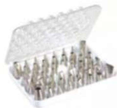
花嘴 Pastry Tube 304 不锈钢 304 Stainless Steel CS8411 52粒装