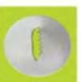
半排花嘴-6(6入) Pastry Tube (pc/bag) 304 不銹鋼 304 Stainless Steel CS8033 17X26X37.5