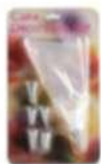
花嘴(小) Pastry Tube 304 不锈钢 304 Stainless Steel CS8400 6粒装