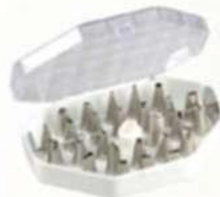
花嘴(韩国) Pastry Tube 304 不锈钢 304 Stainless Steel CS8420 26粒装