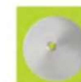
圓花嘴(6入) Pastry Tube (pc/bag) 304 不銹鋼 304 Stainless Steel CS8060 2.5X18X34.5