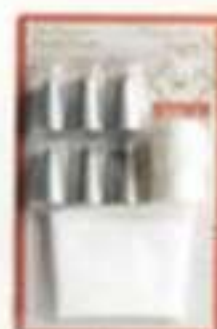
花嘴(大韩国) Pastry Tube 304 不锈钢 304 Stainless Steel CS8406 6粒装