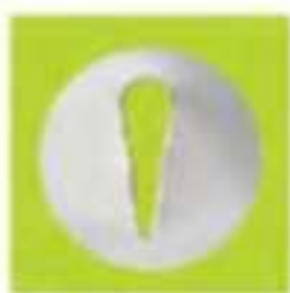
玫瑰花嘴(6入) Pastry Tube (pc/bag) 304 不銹鋼 304 Stainless Steel CS80076 11X18X31.5