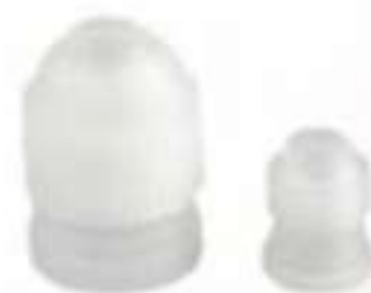
花嘴换模器 Pastry Tube CS8430 小/Small CS8431 大/Large