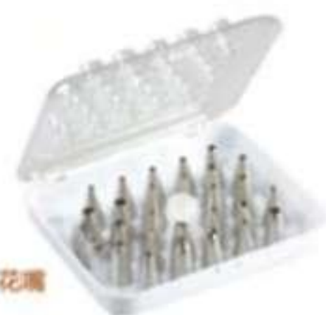
花嘴 Pastry Tube 304 不锈钢 304 Stainless Steel CS8410 26粒装