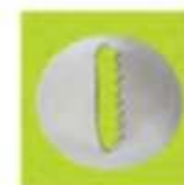
半排花嘴-7(6入) Pastry Tube (pc/bag) 304 不銹鋼 304 Stainless Steel CS80366 13X18X25.5