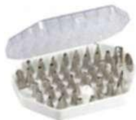
花嘴(韩国) Pastry Tube 304 不锈钢 304 Stainless Steel CS8421 52粒装